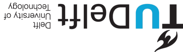
Figure 1: The TUDelft logo upside-down.